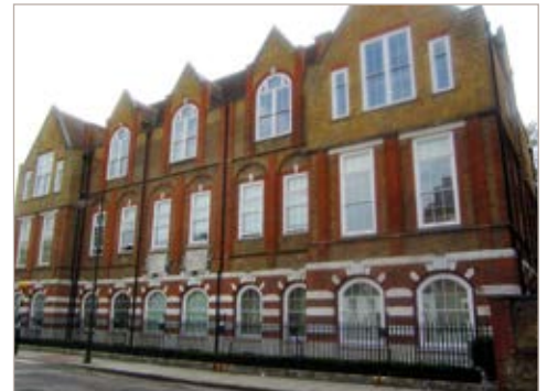
Shepperton Arts Centre, sold 2003