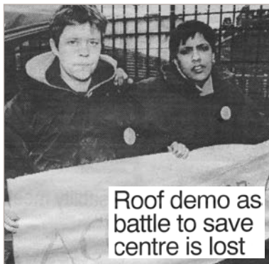
Chequer Centre campaigners

Islington Council and the local MP, Chris Smith, backed the college and a lot of publicity was engineered. The land had been donated four hundred years earlier to benefit local people and had been the site of a school for centuries. Charity lawyers were briefed to challenge the Brewers and after some months the college won. It paid £8 million for a 125 year lease on the site.