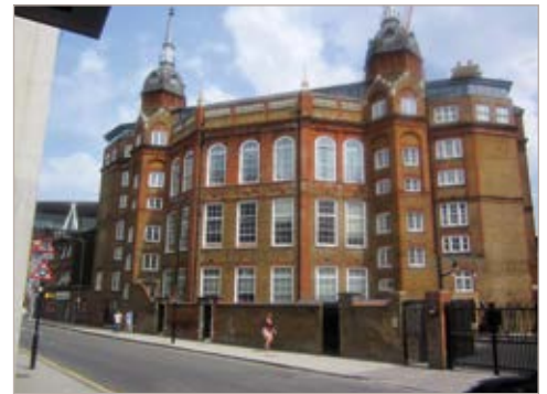
Benwell Road, Holloway, sold 2006