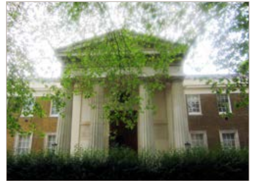
Pitfield Street, Shoreditch, sold 1998