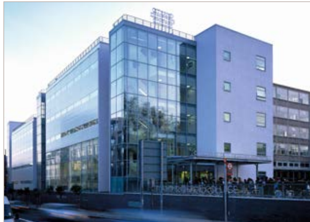
Sixth Form College completed 2003 Architects: van Heyningen and Haward Main contractor: Norwest Holst