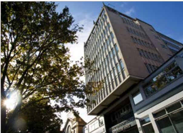
Centre for Health, Social and Child Care, the building is also the college administrative headquarters Refurbished 1995 and partly refurbished 2004 and 2012