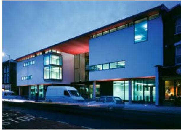
Centre for Lifelong Learning completed 2004 Architects: Wilkinson Eyre Main contractor: Geoffrey Osborne Ltd