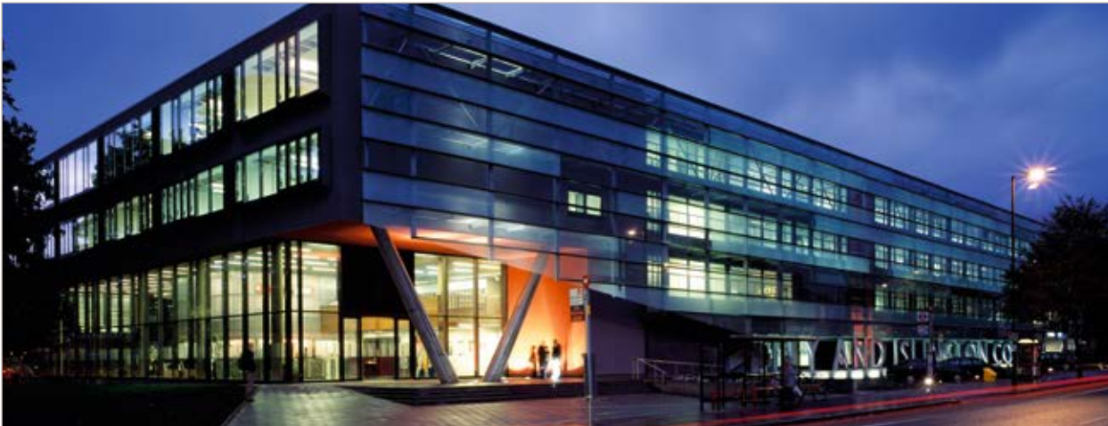
Centre for Business, Arts and Technology completed 2005 Architects: Wilkinson Eyre, Main contractor: William Verry