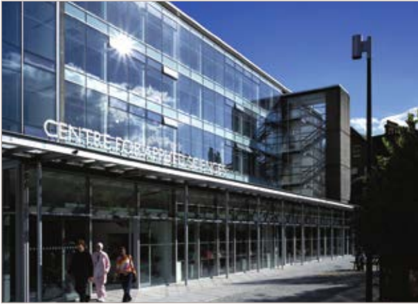
Centre for Applied Sciences completed 2004 Architects: Gollifer Langston Associates Main contractor: Norwest Holst